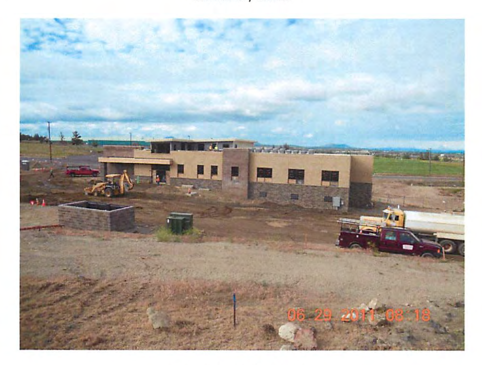
Exterior Nearly Complete.