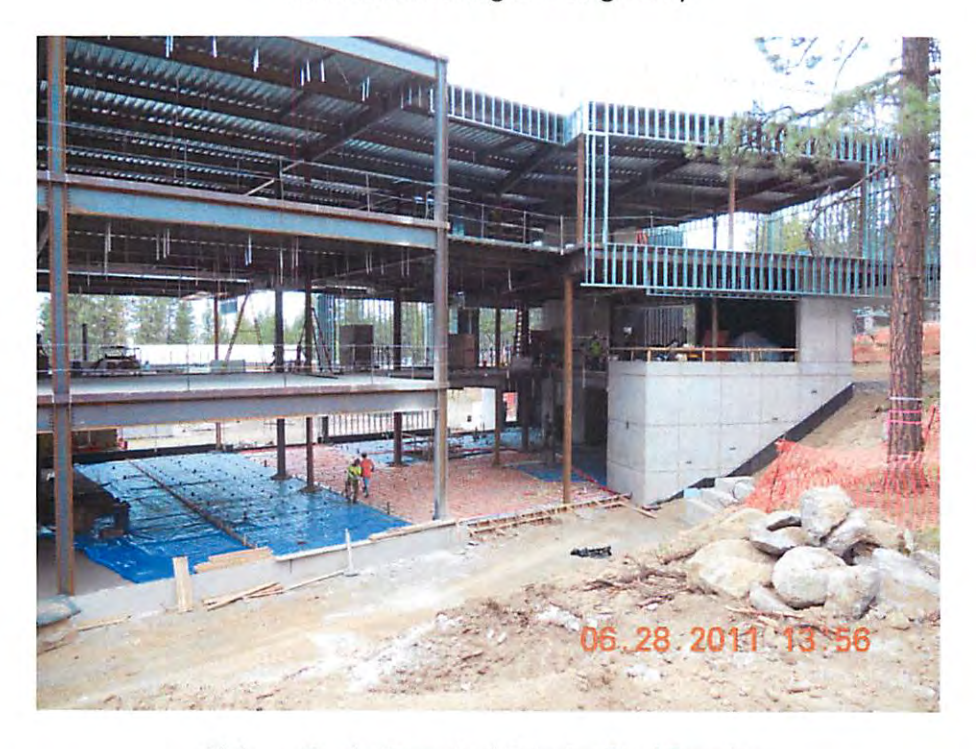
Slab on Grade Prep. And Exterior Stud Framing