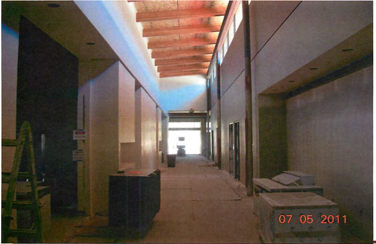
Culinary Building June Update