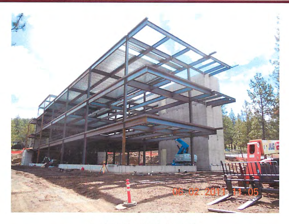
Steel Erection Nearly Complete