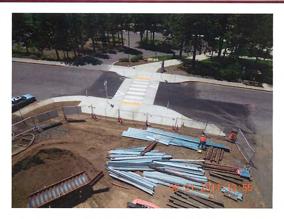
New ADA Crossing at College Way