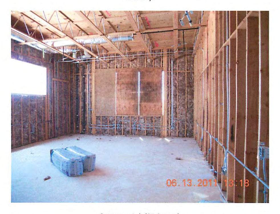
Computer Lab (SE Corner)