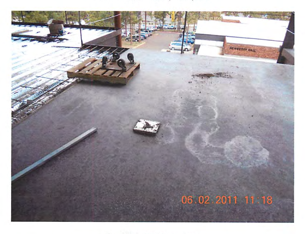
Roof Slab 30% Complete