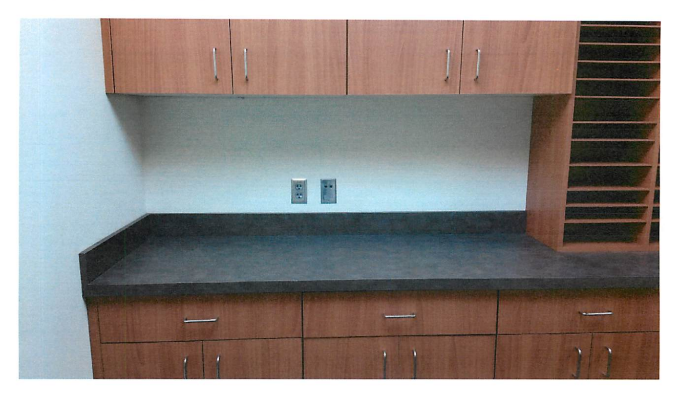
Power and Data – Ochoco, Workroom