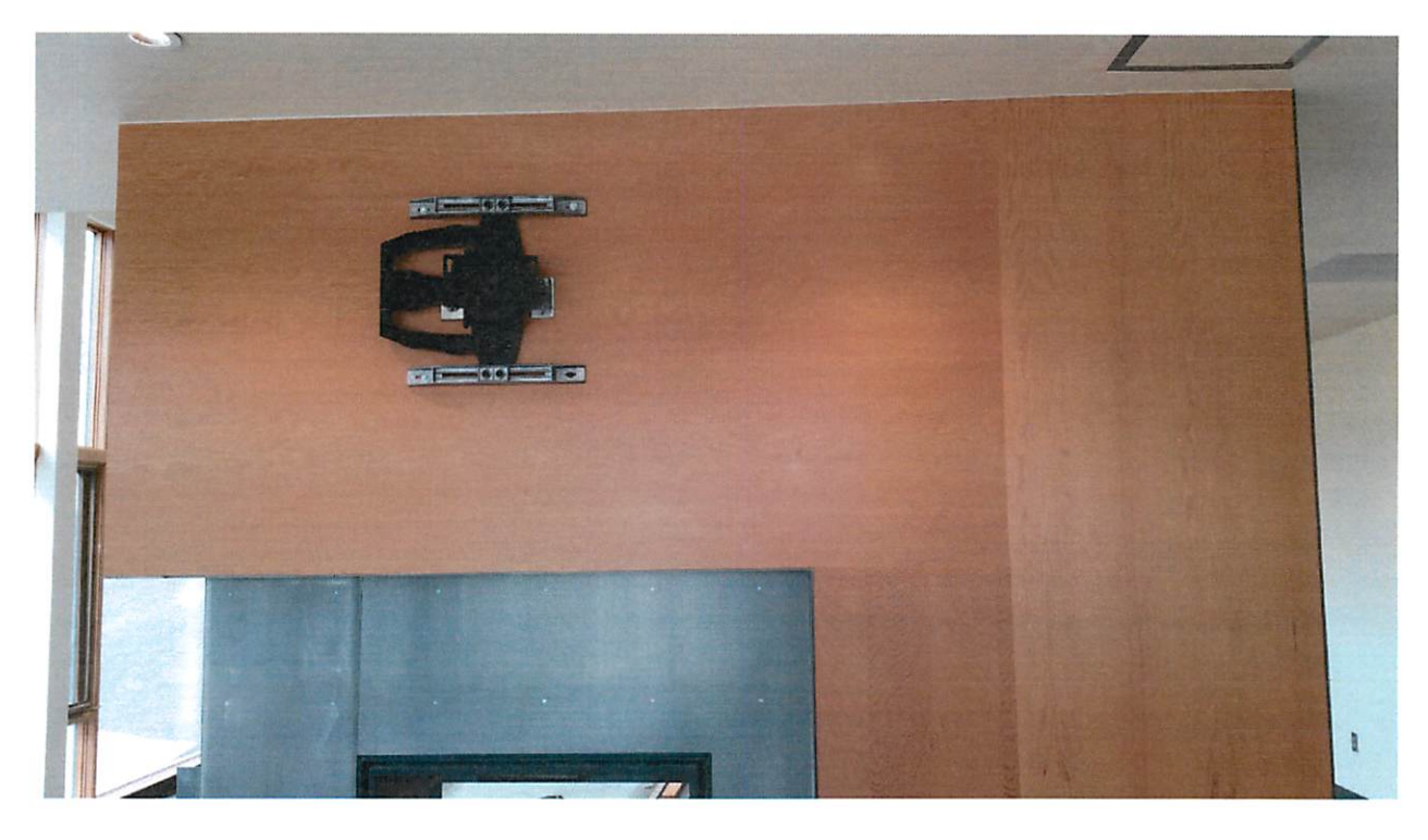
Television Installation – Residence Hall, Lounge Area