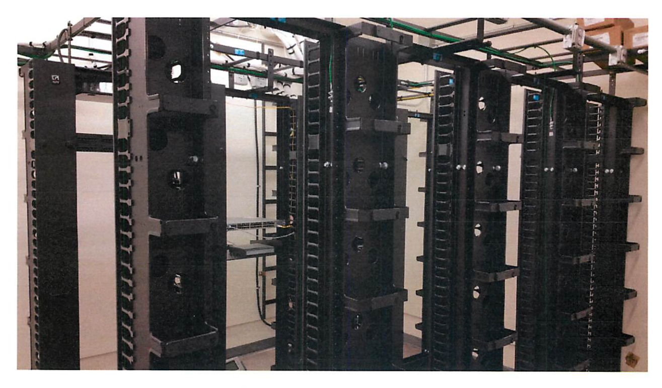
Network Rack Installation – Residence Hall, MDF