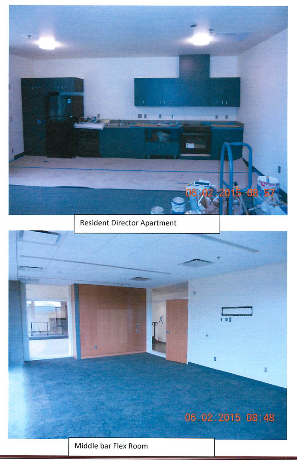
Residence Hall May 2015 Update